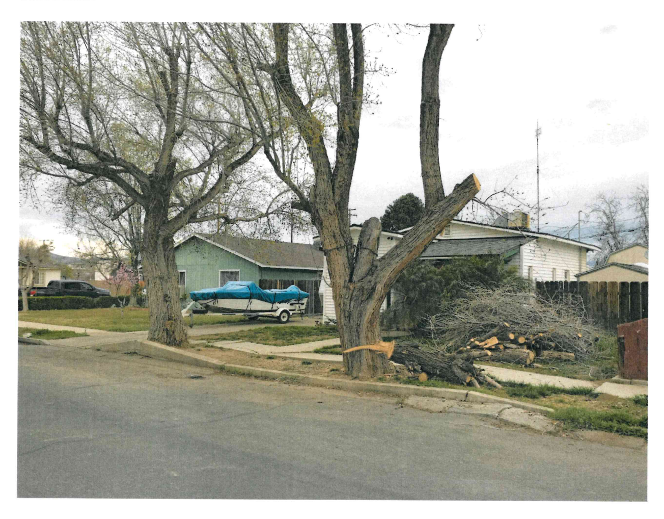
205 Houston Before