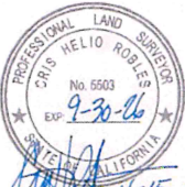
EXHIBIT FOR: COALINGA MULTI-USE TRAIL SEGMENT NO. 7 APN: 071-020-585 CALIFORNIA

TRI CITY Tri City Engineering, Inc. Engineers Surveyors 4630 W. Jennifer Ave. #101 Fresno, CA 93722-6415 PH: 559-447-9075 FAX: 559-447-9074 www.TriCityEngineering.com