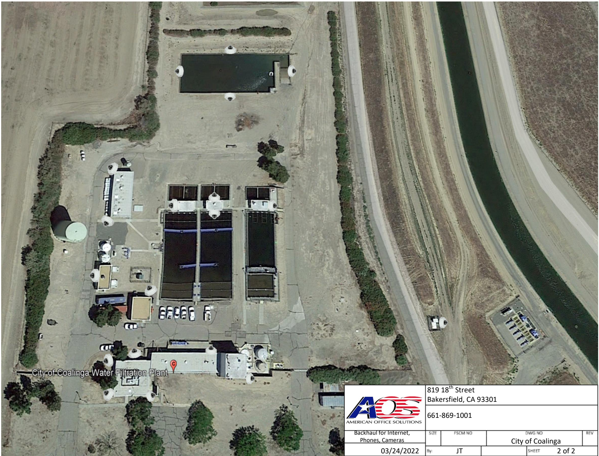
City of Coalinga Water Filtration Plant