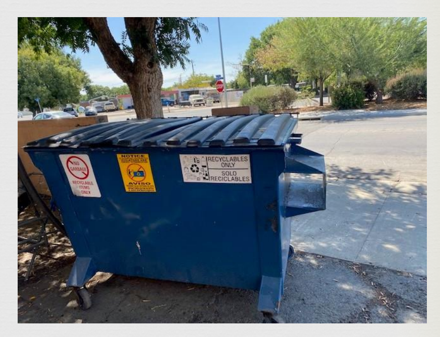
Hong Kong Restaurant